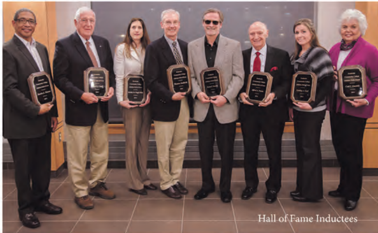
Hall of Fame Inductees

The college's Athletics Department honored eight past athletes, coaches and fans by inducting them on Friday, February 7, into an inaugural Hall of Fame that honors the contributions of outstanding former participants in the college's athletics program. Inductees include: