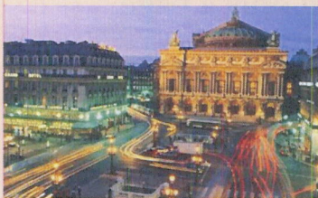
Visit the Opera House!