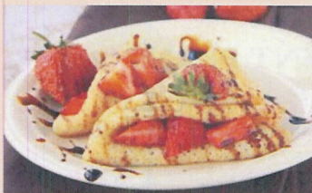
Enjoy French Cuisine!